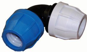
PE4E-PVC4E 3/4" PE X 3/4" PVC ELBOW