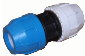
PE4C-PVC4C 3/4" PE X 3/4" PVC COUPLING